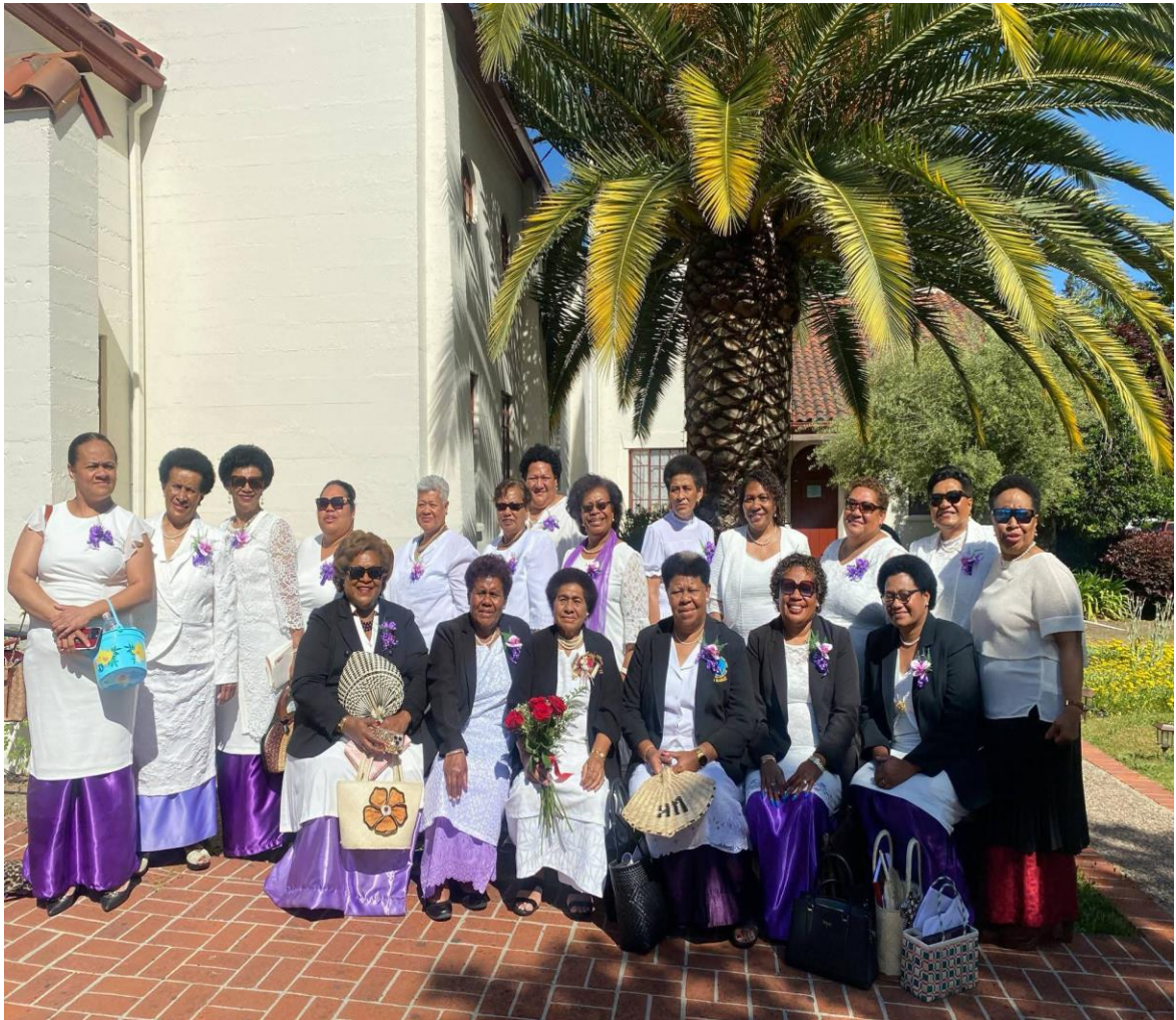
LOTU MASUMASU NI MARAMA 2025